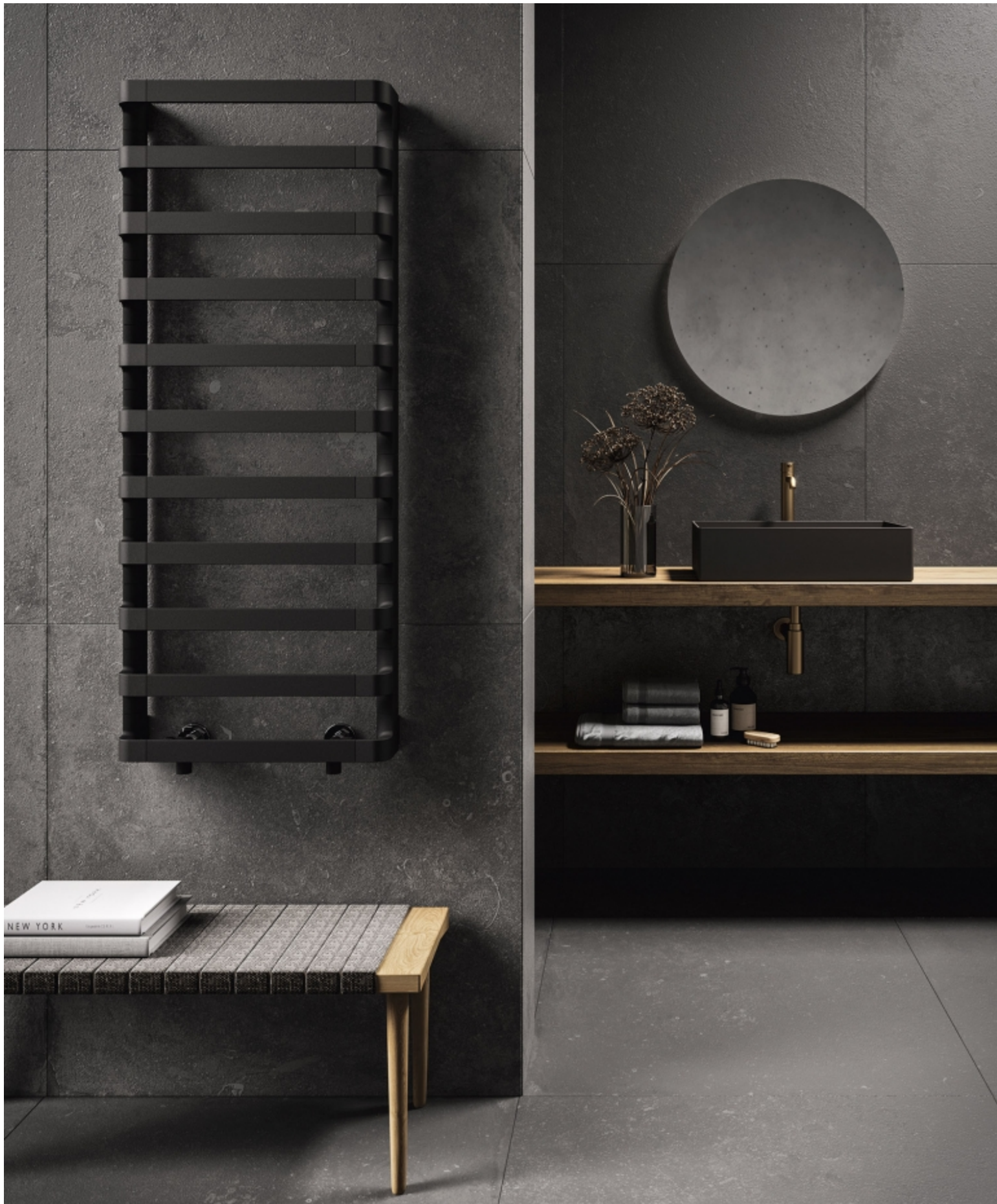
Step B, Hight 1240 mm, Lenght 600 mm, Satin Black