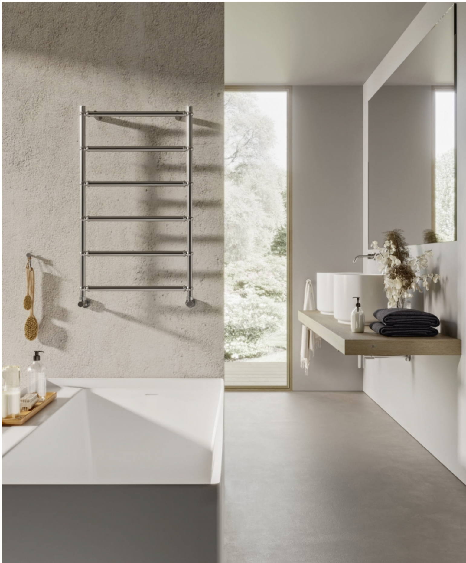
Bella, Hight 875 mm, Lenght 532 mm, Chromium